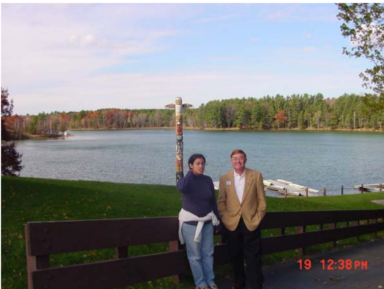
Wisconsin Lions Camp