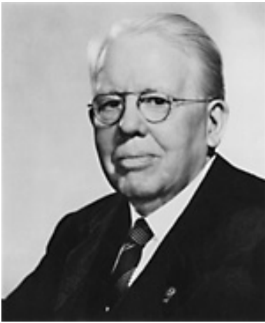
Melvin Jones, Founder of Lions Clubs International in 1917.