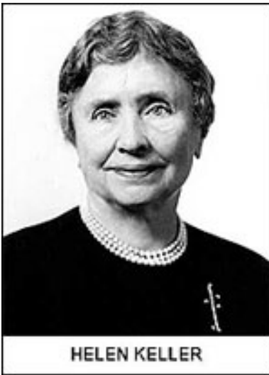
Helen Keller, challenged Lions to be 'nights of the Blind'